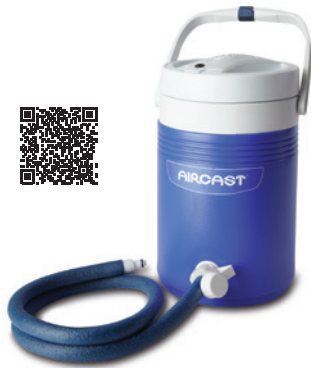
Cryo/Cuff™ IC Cooler