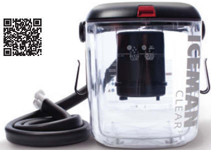
DonJoy® IceMan® CLEAR 3+