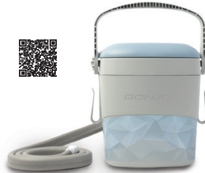
DonJoy® IceMan CLASSIC 3TM*