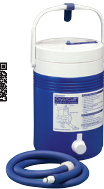
Cryo/Cuff™ Gravity Cooler