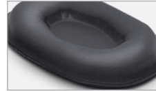
Memory foam condyle pad