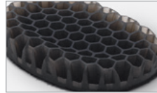
Silicone condyle pad

Customize your brace even more with accessories and team colors