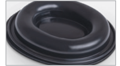
Air condyle pad

The best wear and win with DonJoy® custom braces